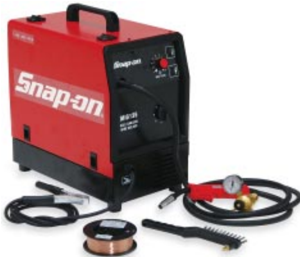
MIG135 120V MIG Welder

Use with .023" to .035" solid steel wire & gas or as gasless wire feed welder when used with flux-cored welding wire